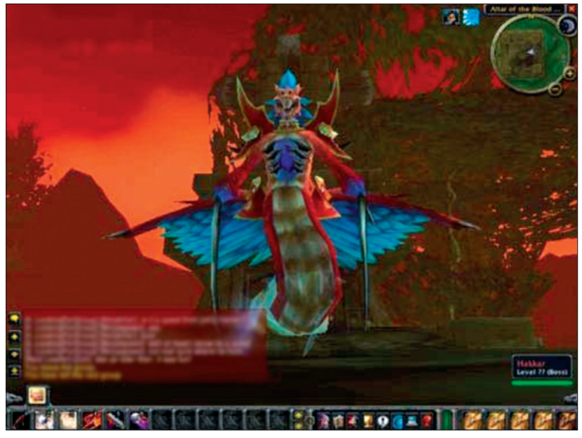
Figure 2: Hakkar, the primary source of infection in World of Warcraft

game, keeping them in stasis until they can be healed or otherwise safeguarded after the dangers of combat have gone. These pets, therefore, acted as carriers of the disease and also served as a source of disease by causing new outbreaks when brought out of stasis—even if their owner had recovered and was no longer infectious. Based on player accounts, pets, as opposed to the infective characters themselves, seem to have been the dominant vectors for the disease. Players would return to densely