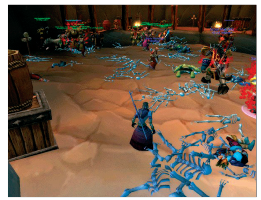
Figure 1: Urban centre in World of Warcraft during the epidemic

For more information on World of Warcraft see http:// worldofwarcraft.com See Online for webfigure