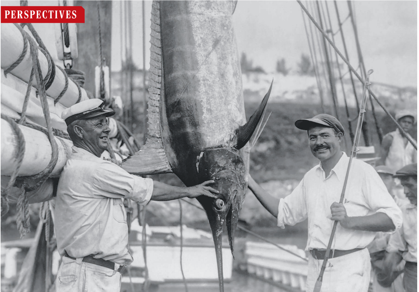
Unnatural selection. Human hunters and fishers (such as Ernest Hemingway, pictured with a marlin) specialize in adult prey and often target large, healthy individuals.