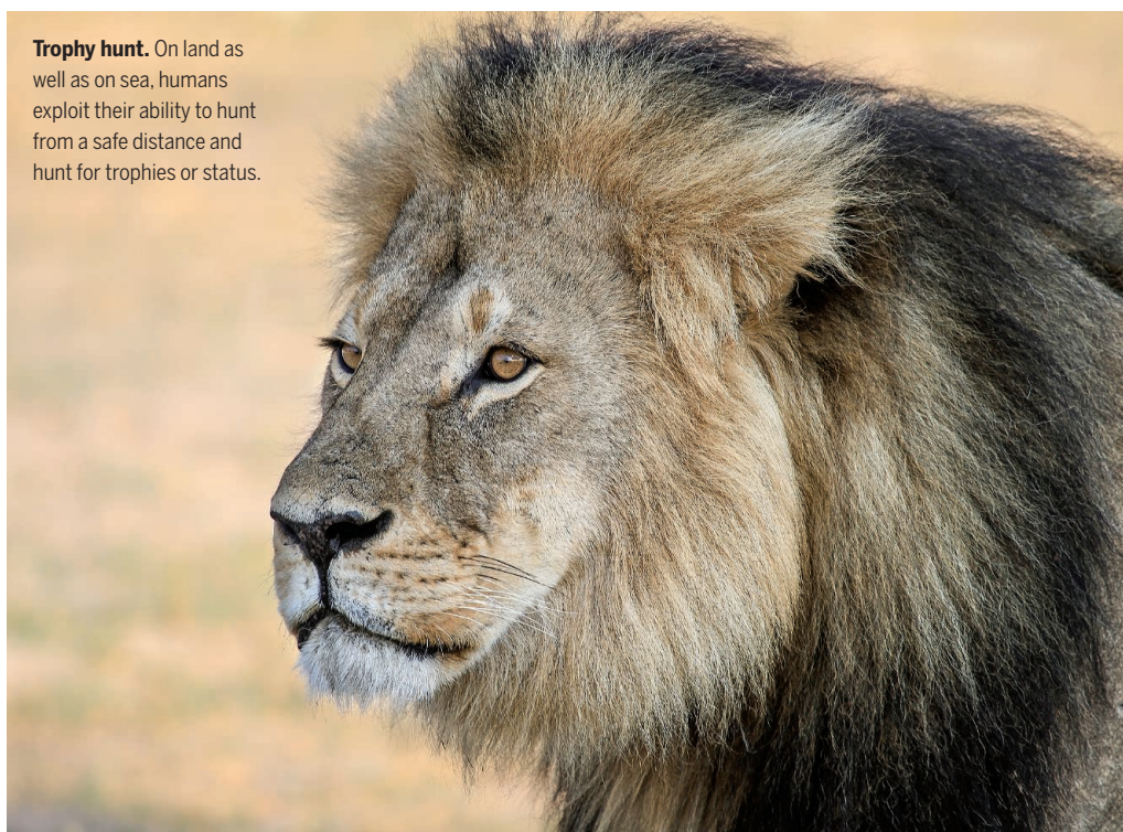
Trophy hunt. On land as well as on sea, humans exploit their ability to hunt from a safe distance and hunt for trophies or status.

Two potential biases are associated with research into human effects on contemporary wildlife. First, there is survivorship bias: We only measure what is left. Many vulnerable wildlife species on land have already disappeared during the past 40,000 years in successive waves of extinction on continents and islands that were