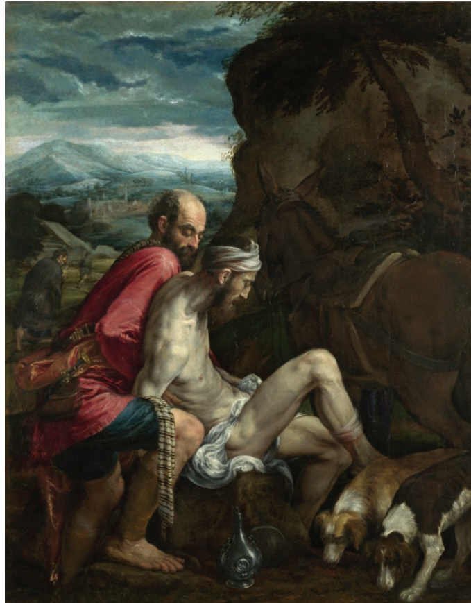
Fig. 1. In the parable of The Good Samaritan [painting by Jacopo Bassano, d. 1592, copyright 2006, The National Gallery, London], Christ preaches universal compassion and prosocial behavior. A similar message is found in many religions. Modern research from social psychology, experimental economics, and anthropology suggests, however, that religious prosociality is extended discriminately and only under specific conditions.

In several behavioral studies, researchers failed to find any reliable association between religiosity and prosocial tendencies. In the classic “Good Samaritan” experiment (22), for example, researchers staged an anonymous situation modeled